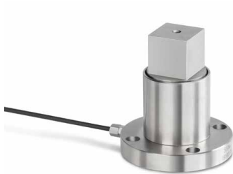
DC Y1 Alloy steel static torque sensor