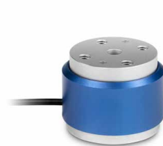
DC Y2 Alloy steel static torque sensor